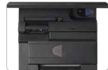
Optional Built-in MSR Fingerprint Sensor and RFID Reader