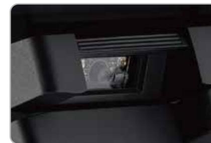
2D Barcode Scanner

Dressed from head to toe in timeless black or white color, the only trend that never goes out of style, and with stylish touches added throughout, the HS-6500 Series is not just a piece of machinery, it is an elegantly crafted piece of art that looks right at home in any store decoration.