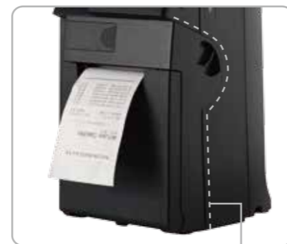
Detachable Receipt Printer

The HS-6500 Series integrates the most widely used peripherals including 3" thermal printer, MSR, fingerprint sensor, 2D barcode scanner and 2 nd customer display to support your daily POS operation. The detachable modularized design allows quick access to the components, enabling fast and easy service and upgrades.